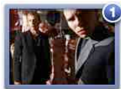
Delivery to iTunes