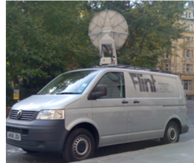
Flint's IP truck